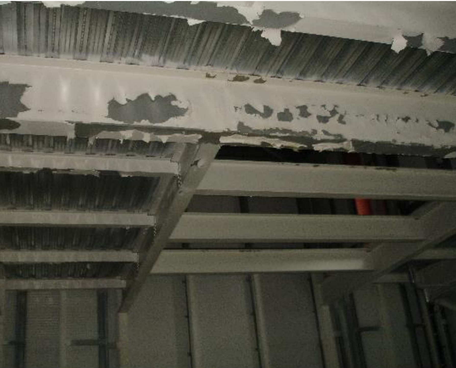
Defective paintwork on interior steel frame